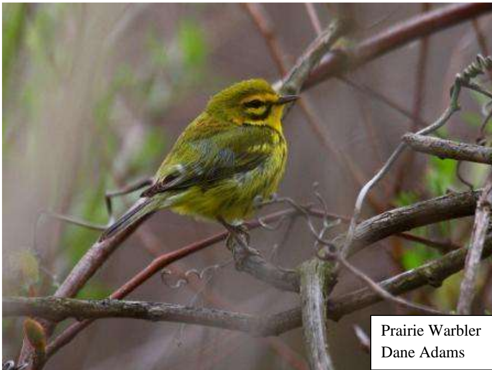
Prairie Warbler Dane Adams