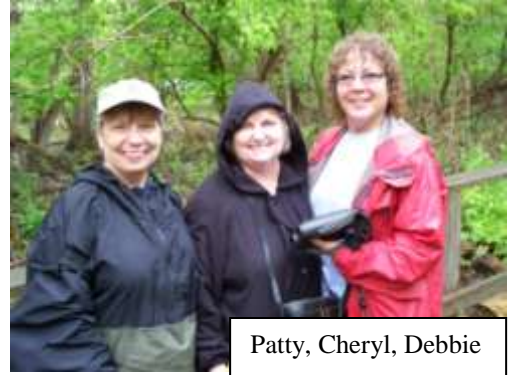
Patty, Cheryl, Debbie

Nashville Warbler , Northern Parula, Yellow Warbler, Chestnut-sided Warbler, Black-throated Blue Warbler, Yellow-rumped Warbler, Black-throated Green Warbler, Blackburnian Warbler, Pine Warbler, Palm Warbler, Blackpoll Warbler, Cerulean Warbler, Black-and-white Warbler, American Redstart, Prothonotary Warbler, Ovenbird, Northern Waterthrush, Kentucky Warbler, Common Yellowthroat, Wilson's Warbler,