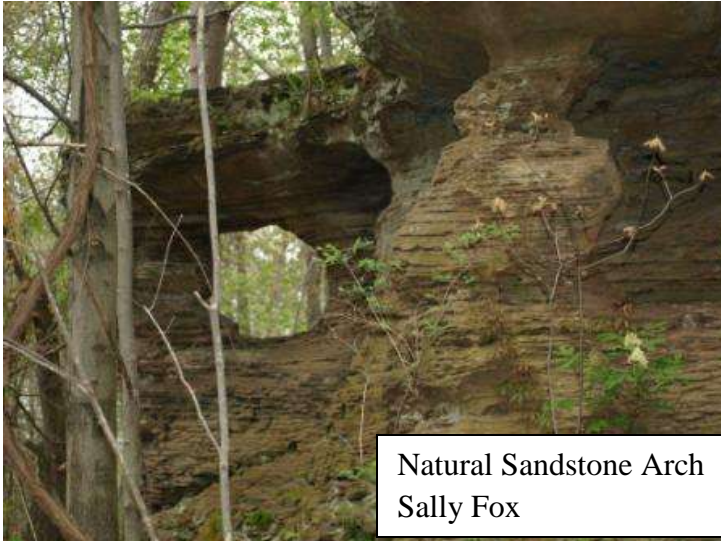
Natural Sandstone Arch Sally Fox

Outstanding features are the naturally formed sandstone arches, unique within Ohio.