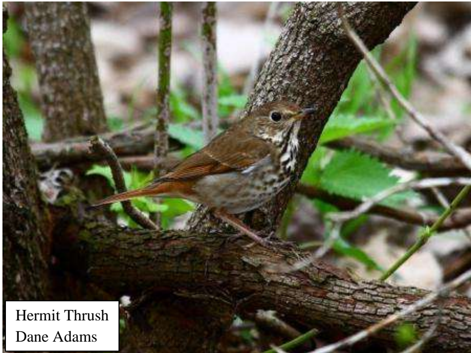
Hermit Thrush Dane Adams