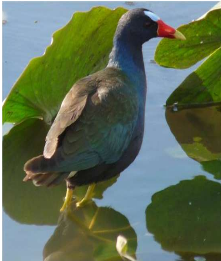
Purple Gallinule at Columbia Reservation Dave Priebe