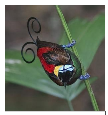
WILSON'S BIRD of PARADISE

As a tourist and budding birder in 1973 I visited Papua New Guinea with a group that spent a few days leisurely